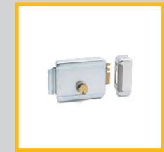
Lock Electrical lock