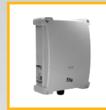
ARO 220V Rinosec Control board