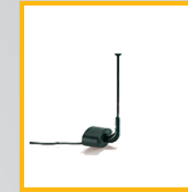
VITO accessories Antenna