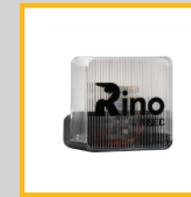
VITO 220V Blinker