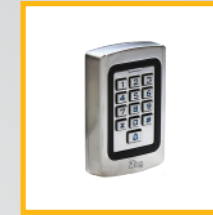
ARO access keypad