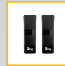
VARIO 12/24V Photocell