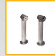
VARIO accessories Bracket