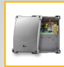
UNIMOG 220V Rinosec Control board