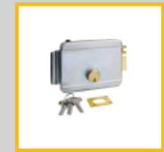
Lock Electrical lock