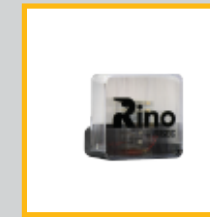
VITO 220V Blinker