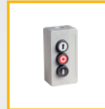
UNIMOG Push bottom