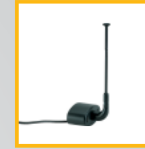
VITO accessories Antenna